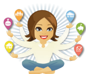
Aged Care Gurus

This advice is of general nature only and is based on current laws and their interpretation. The application of the information in this document will depend on the individual's circumstances. Before making any investment decisions, we recommend you consult a financial adviser to take into account your particular investment objectives, financial situation and individual needs. This information is not advice and should not be acted upon without independent and specific advice taking into account the individuals specific needs and circumstances.